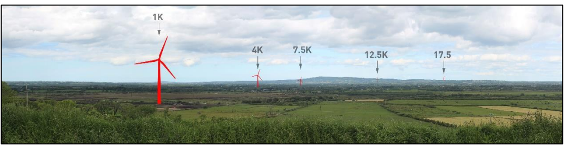
Figure 1-1 The effect of distance on visibility of wind turbines (Illustrative Purposes Only)